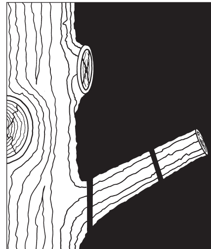
Proper pruning: A ring of callous (top) will form over a good vertical cut. First cut away the limb to remove the weight, making initial cuts from the bottom. Then cut the stub from below.

Under no circumstance should trees be topped. Not only does this prac-